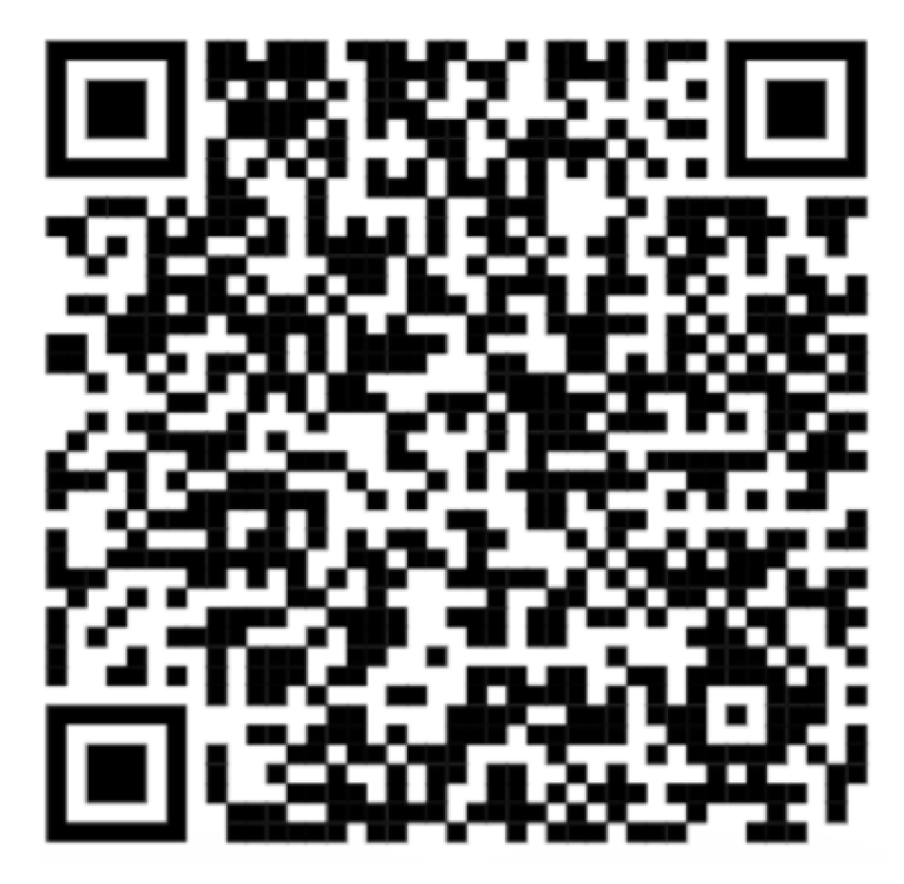
Sign a pledge today online or ask Francis for a paper pledge!

To learn more, go to workplacecharging.com.